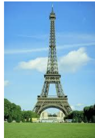
GLAC 2014 2 - 4 June 2014