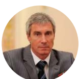
Sergey Krikalev (ROSCOMOS, Director of Human Spaceflight; IAF Vice President for International Relations and Outreach)