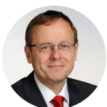
Jan Woerner (ESA, Director General; IAF Vice President for Agency, Parliamentarian and Ministerial Relations))