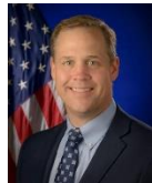
Jim Bridenstine Administrator, NASA

In addition to these evening events, this year WD/YPP is also hosting a NASA YP Town Hall GNF session. This GNF will feature NASA leadership’s message for YPs and time for the YPs in attendance to interact with and ask questions of our host agency.