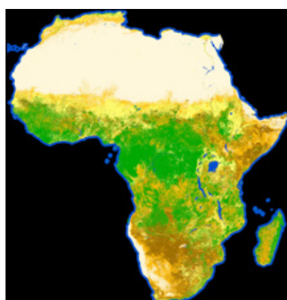
Changes in land – Sentinel 2-A

All three are strongly related to sustainability and development, as well as environmental sustainability in particular.