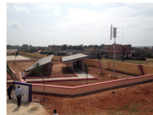
Water treatment unit in Morocco

With the adoption of the United Nations 17 Sustainable Development Goals in September 2015, goals to be reached by all countries by 2030, the nations of the world have decided on ambitious goals for their people, prosperity, the planet, peace and partnerships. And “space” as a tool can support the measurement of and the improvement of each of these goals, already today with actual programmes, and much more tomorrow with all the programmes that are being prepared by ESA. Worth to be noted that all domains contribute one way or another to one or more of these goals, from Earth observation, telecommunications, positioning, technology or Human spaceflight to operations. We do not pretend space can solve all challenges on Earth and be “the” answer to development, but we are convinced and know that space can be a very valuable contributor.