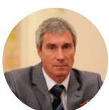
Sergey Krikalev (ROSCOMOS, Director of Human Spaceflight; IAF Vice President for International Relations and Outreach)