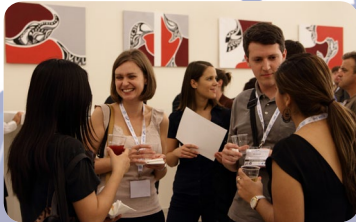
Young Professionals' reception