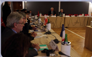
International Meeting for Members of Parliament