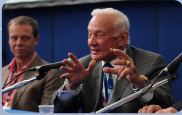
Buzz Aldrin at IAF Global Networking Forum