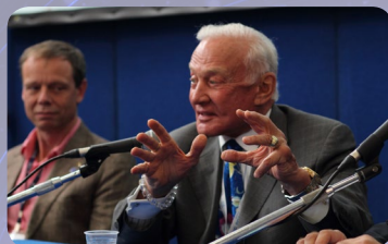
Buzz Aldrin at IAF Global Networking Forum