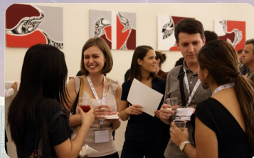
Young Professionals' reception