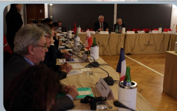
International Meeting for Members of Parliament