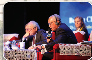
Heads of Agencies events