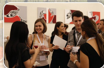
Young Professionals' events